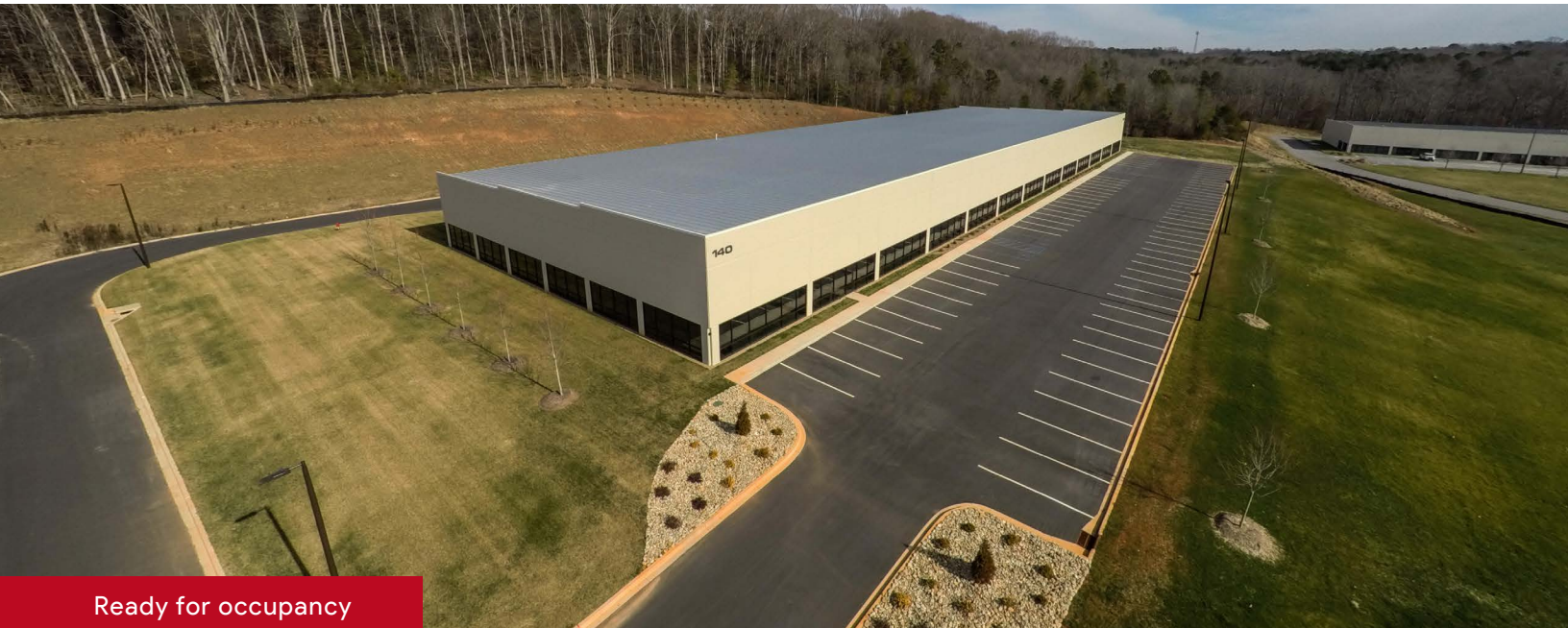
Ready for occupancy