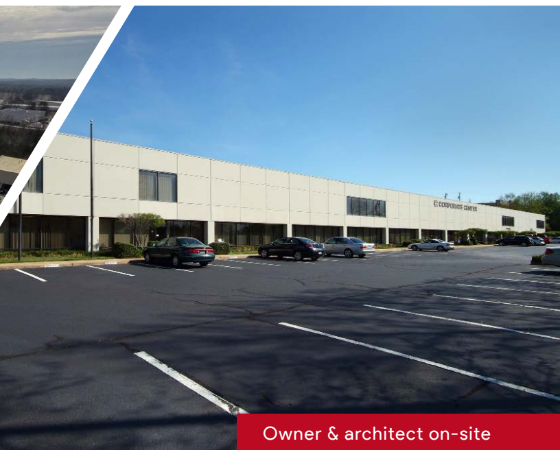
Owner & architect on-site